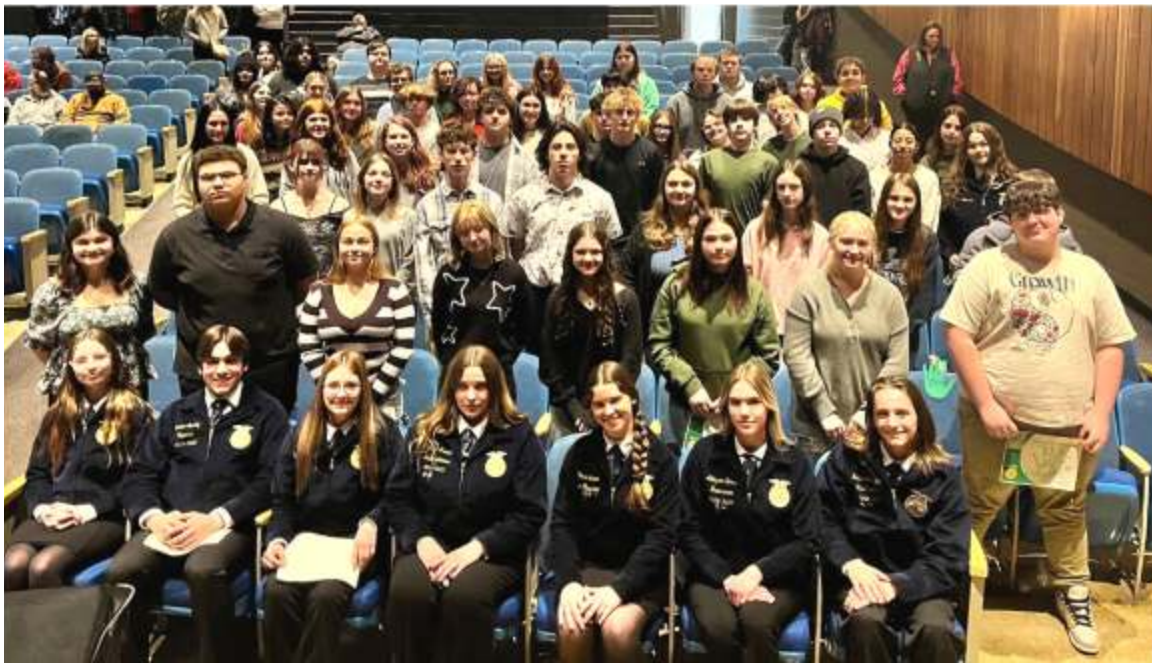
Greenhand recipients and officers.