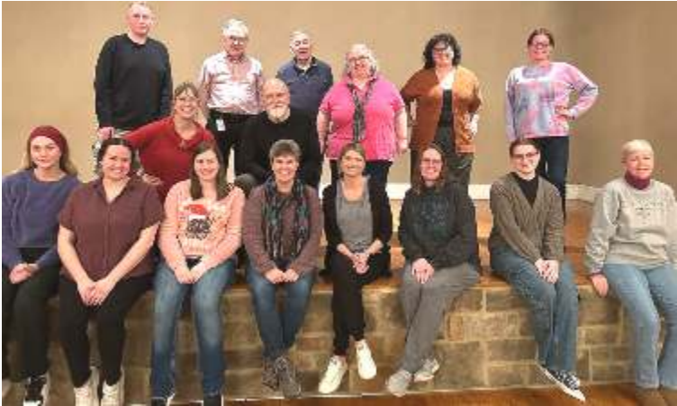
Some of the cast and crew of The Book of Will doing a read through and checking out the performance space at Maria's at 129 E. Main St. in Lancaster.